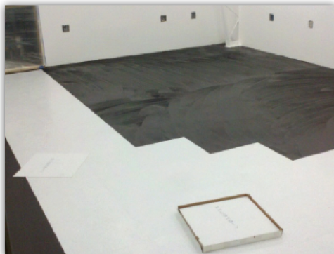
FreeStyle™ CVT being installed in a server room, using trowel-on, 1-part, conductive adhesive.

(Can also be installed with our new sprayable, conductive adhesive.)