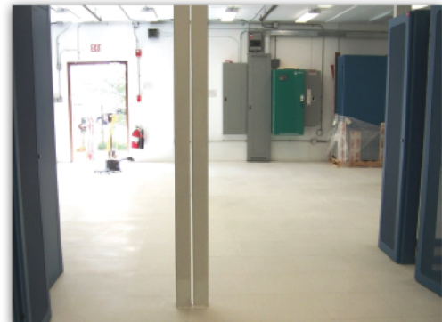
FreeStyle™ CVT provides industry-leading static protection in this server room application.

(Can also be installed with our new sprayable, conductive adhesive.)